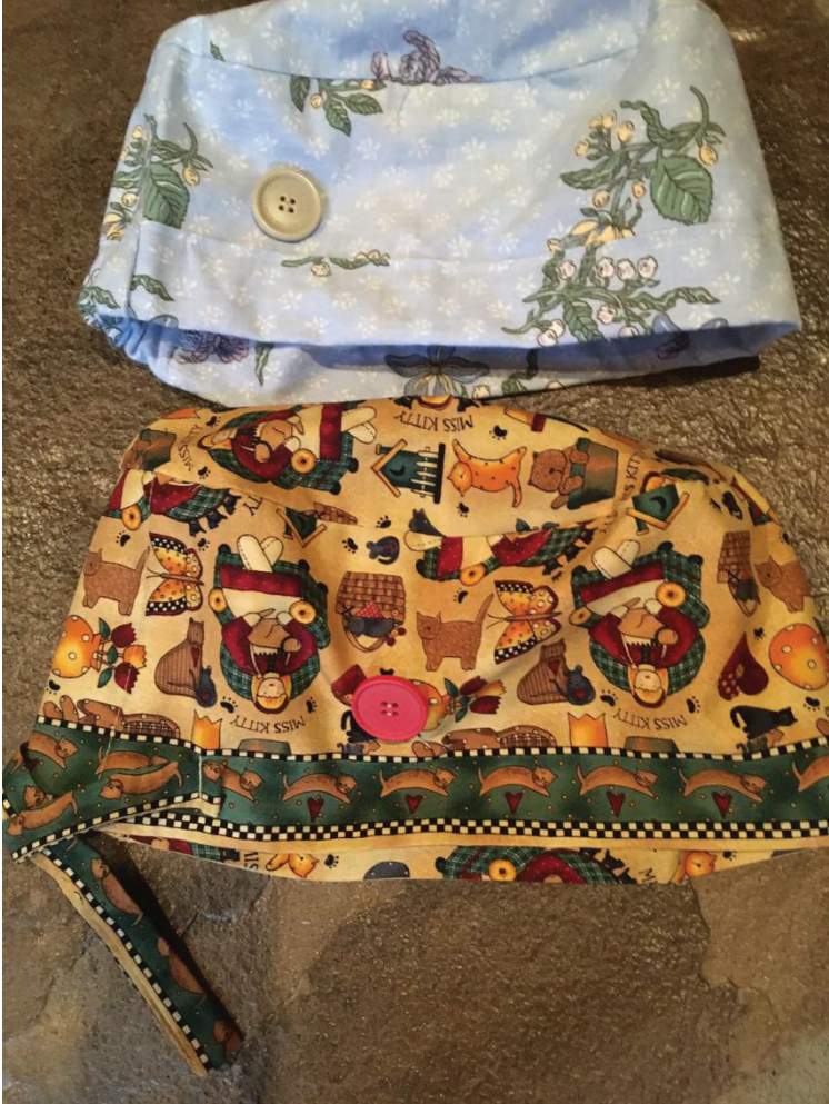
Surgical Caps for the Health Centres

WORK FROM THE WHISTLER VALLEY QUILTERS' GUILD – SEPT 2020 TO DATE (Feb15,2021)