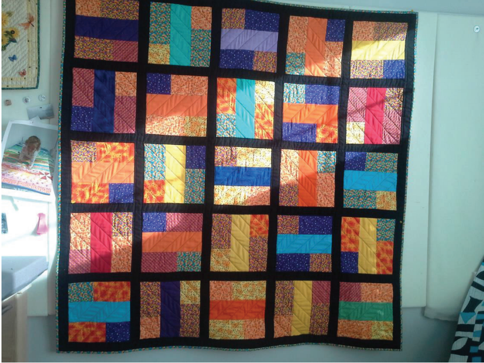
Three Community Quilts Made and Donated by Members