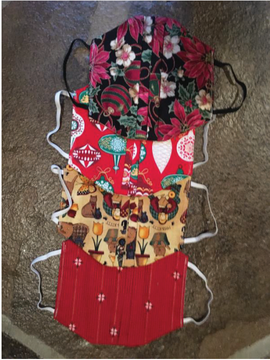
Masks for the Health Centres