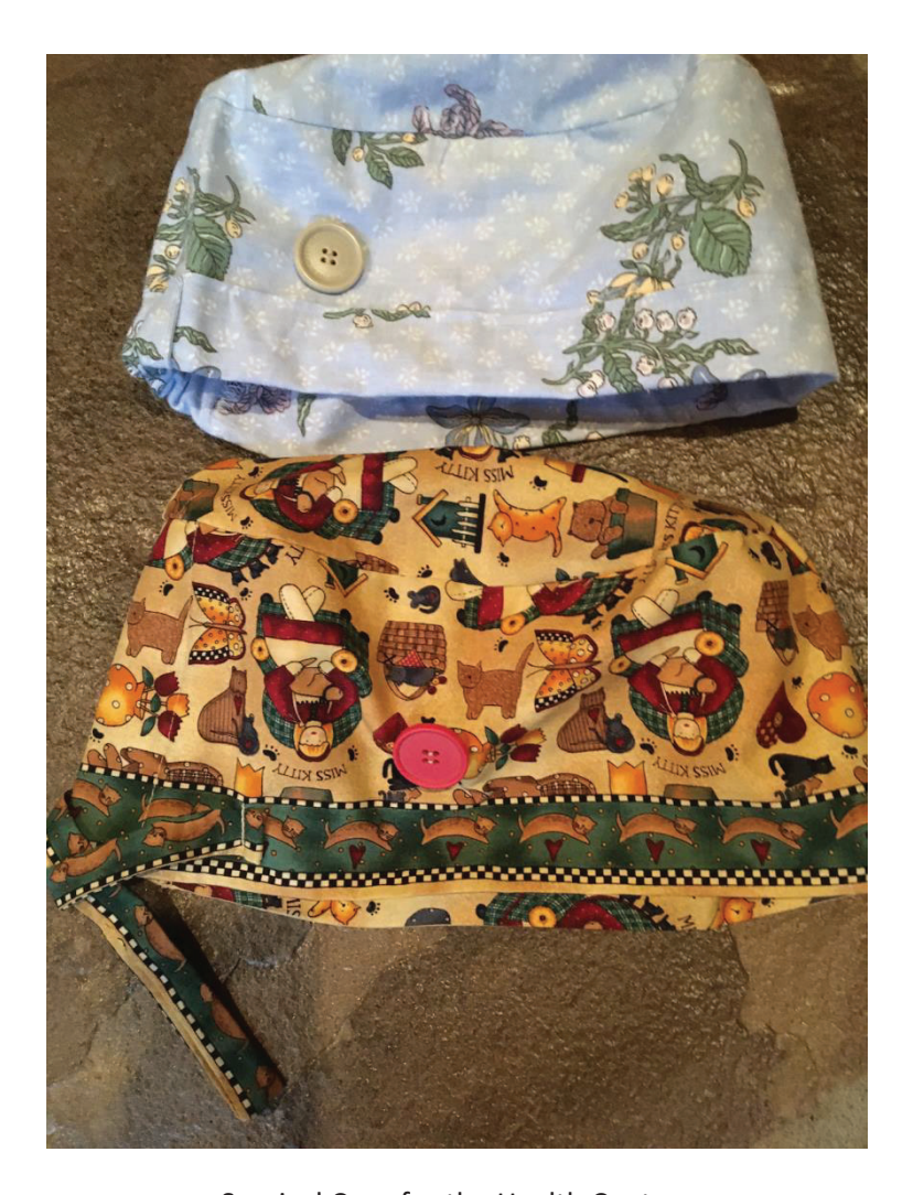
Surgical Caps for the Health Centres