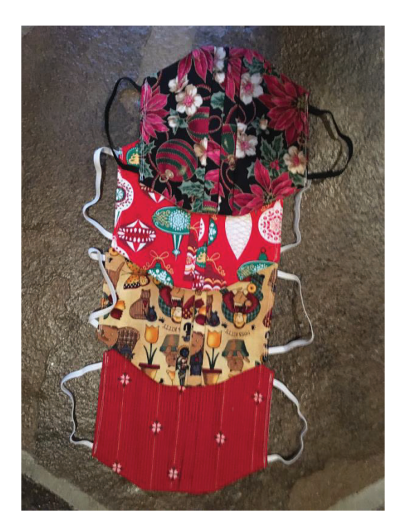
Masks for the Health Centres