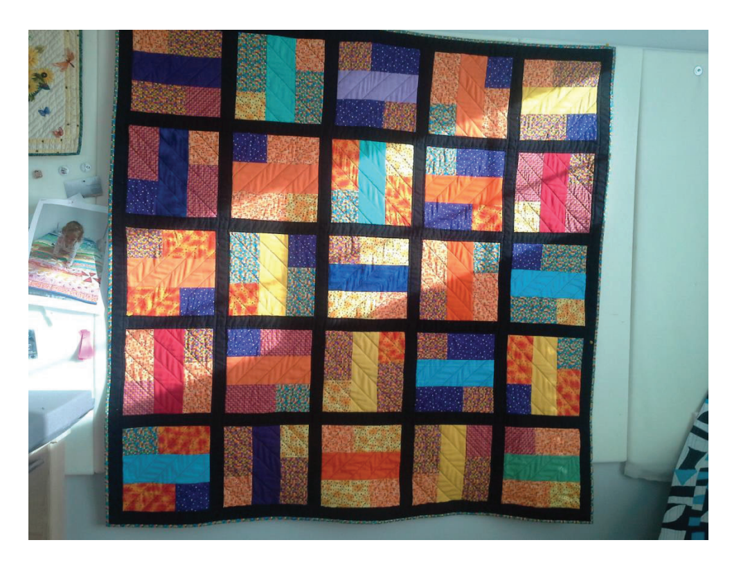
Three Community Quilts Made and Donated by Members