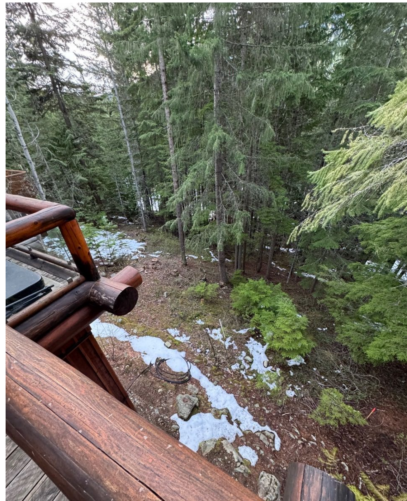
View from deck at 6441 St. Andrews Way towards (west) rear parcel line abutting RMOW park lands