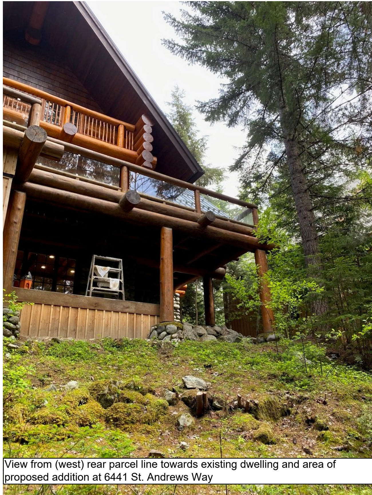
View from (west) rear parcel line towards existing dwelling and area of proposed addition at 6441 St. Andrews Way