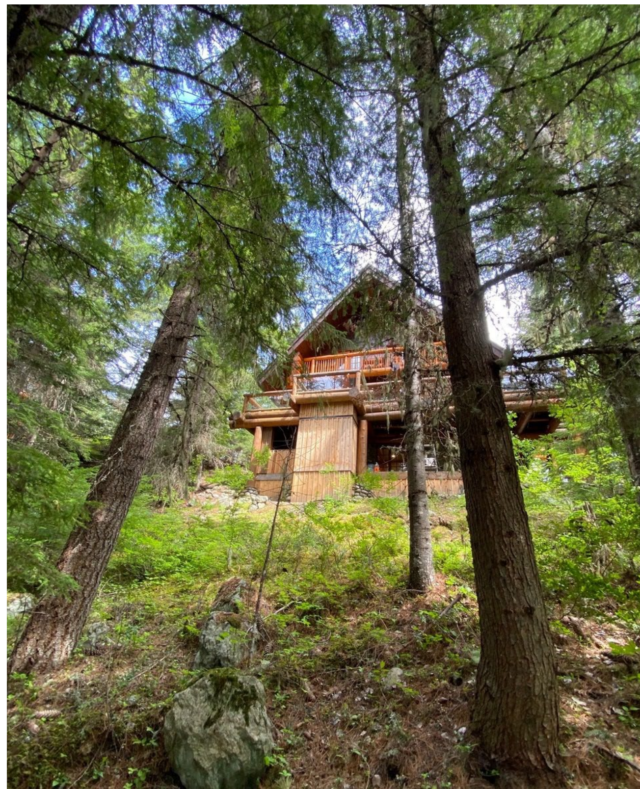
View from (west) rear parcel line towards existing dwelling at 6441 St. Andrews Way