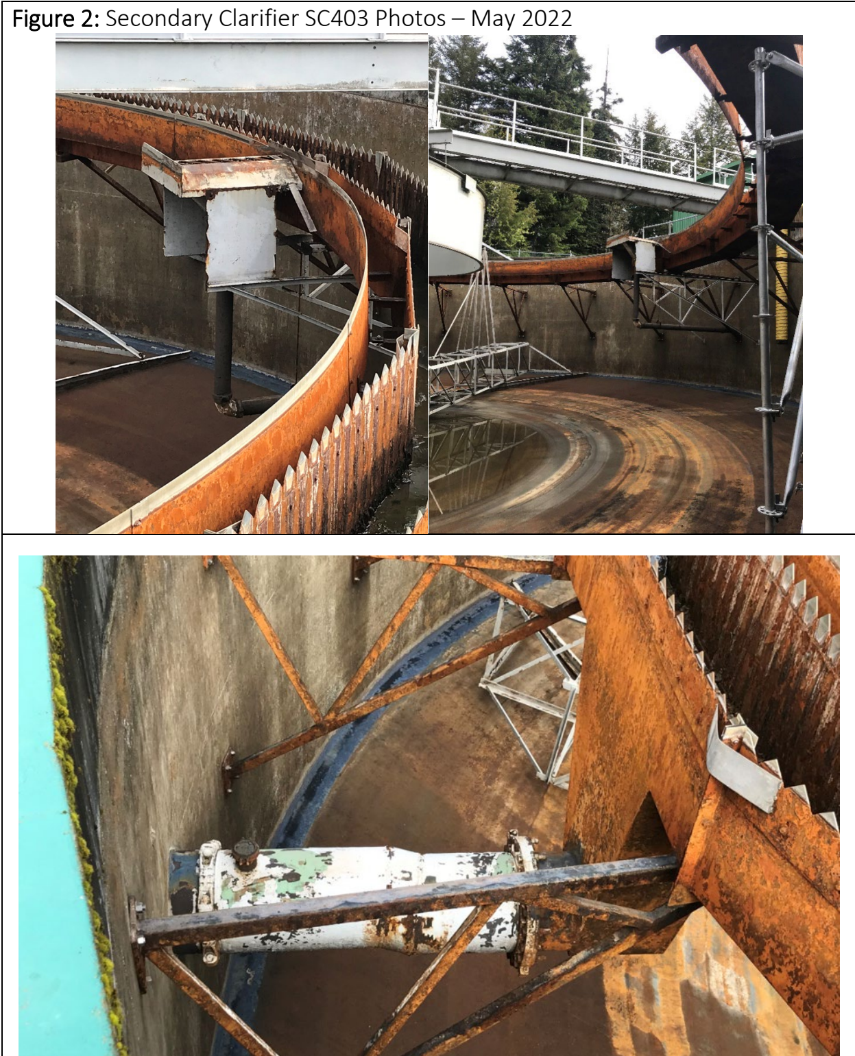
Figure 2: Secondary Clarifier SC403 Photos – May 2022