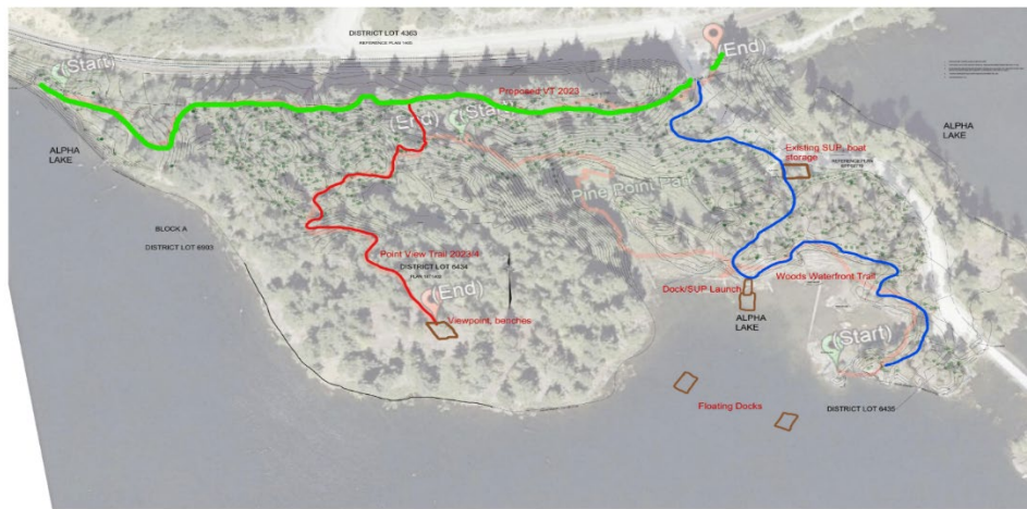
Figure 2: Proposed Pine Point Park Improvements