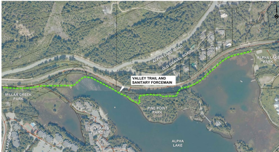
Figure 1: Proposed Valley Trail and Sanitary Forcemain Alignment